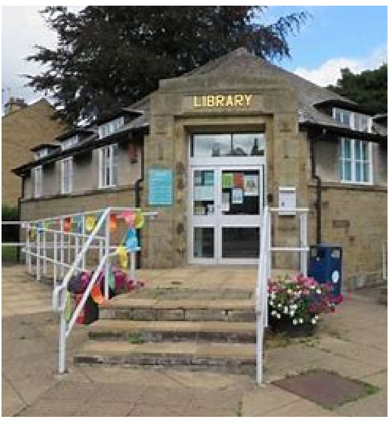
Honley Library is owned by Holme Valley Parish Council and managed by the Friends of Honley Library

We have continued to maintain the many assets for which we hold responsibility on behalf of the community. These include the Holmfirth public toilets, benches, war memorials, decommissioned telephone boxes, dog waste bag dispensers and stone bus shelters. I would like to thank our maintenance contractor and also the many volunteers who ensure that these facilities remain available for the benefit of the community and of visitors to our beautiful valley.