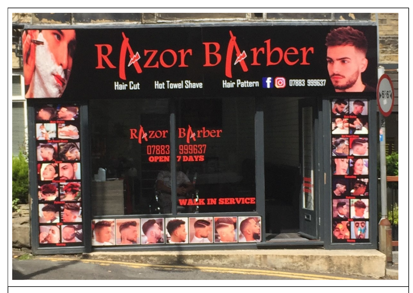
Razor Barber 20, Huddersfield Road, Holmfirth