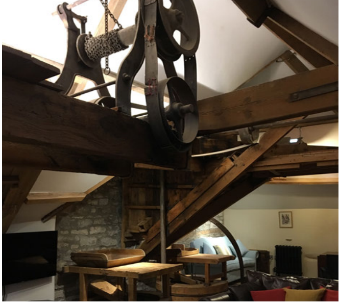
Machinery retained in its original position and creating a striking feature of interest in this former 18th-century corn mill.