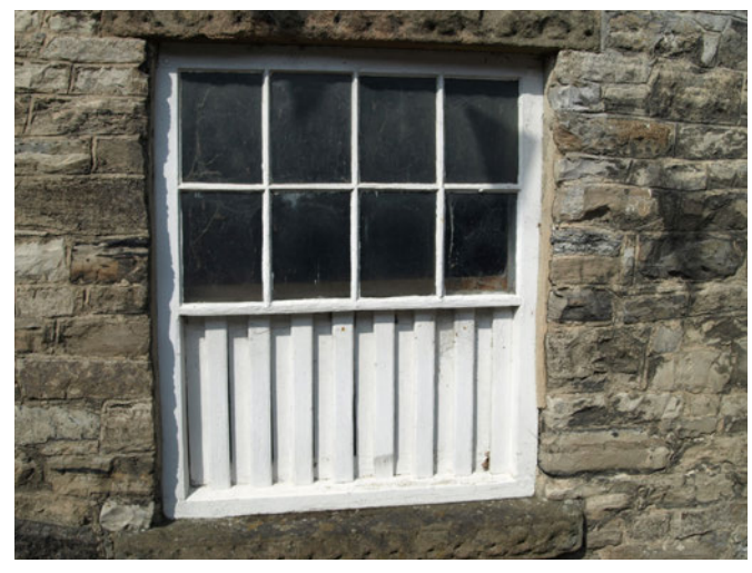
A traditional window with glazed upper and 'hit and miss' vents below.