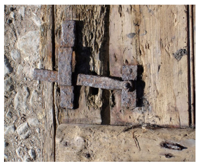
A simple iron latch on a historic door.