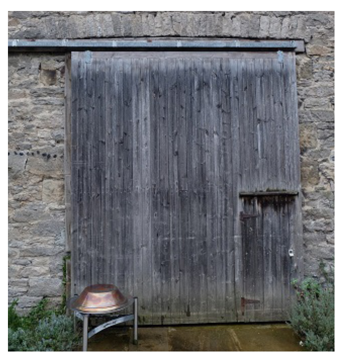
The 20th Century sliding door on this threshing opening, although not part of the original building, has been retained and can be closed to cover the new glazed opening behind it. This maintains the agricultural feel of the converted barn and helps to tell part of the building's history.