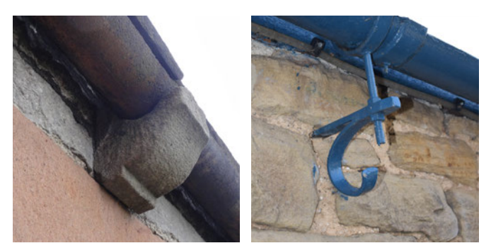
Left: Stone support for a cast iron gutter on a historic barn. (© Oldfield Design Ltd). Right: Metal bracket gutter support on a former smithy. (© PDNPA)