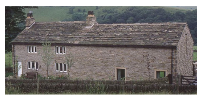
Barn adjoining the farmhouse has been converted to domestic use but retains a distinct utilitarian character.