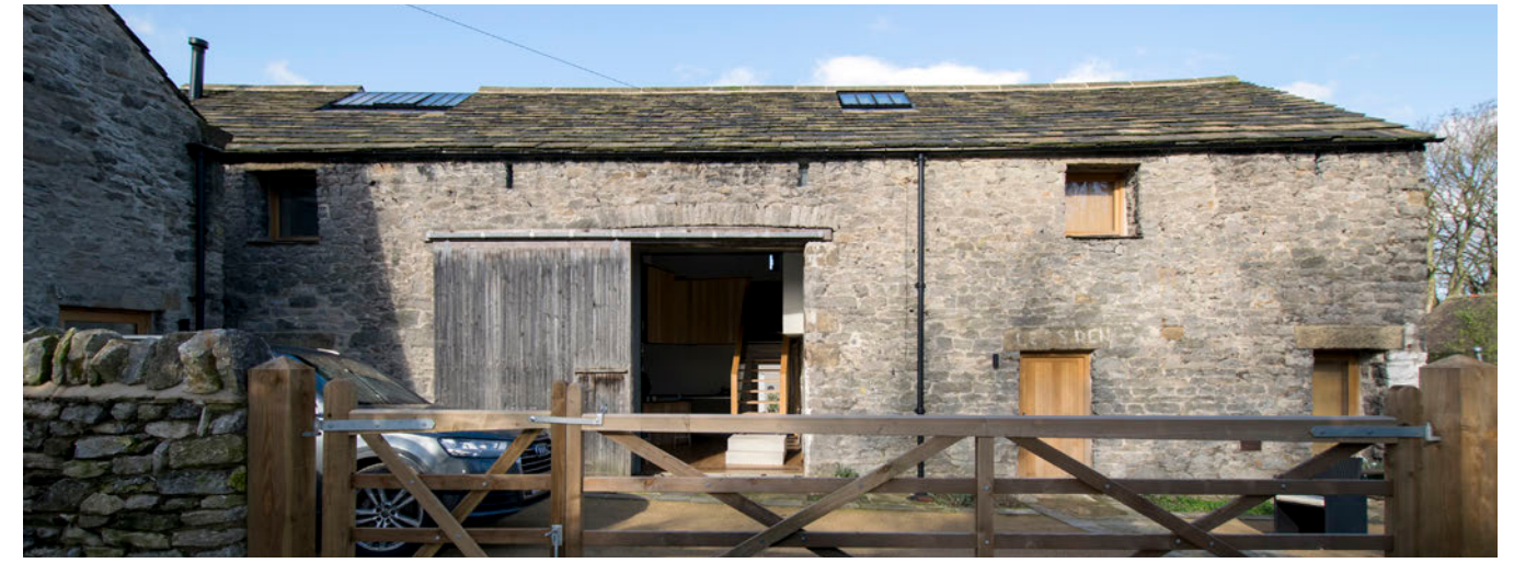
A barn after conversion to domestic use. The retention of the large sliding door and the careful use of existing openings with simple woodwork and internal shutters helps to maintain the agricultural character of the building. The interior is very modern but responds to the historic uses of space. (© CE+CA Architects)