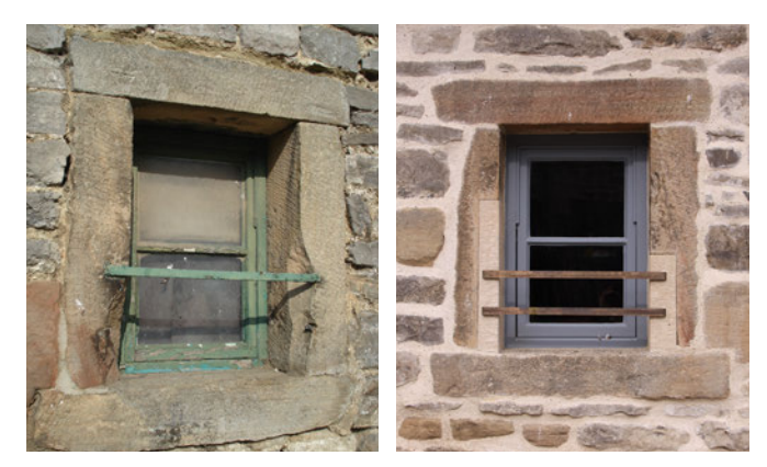
A like-for-like replacement of an historic window, including stonework repairs and new ironwork, based on evidence from the existing openings.