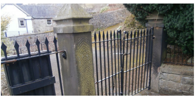
Gate piers and iron railings forming the boundary of a chapel curtilage.