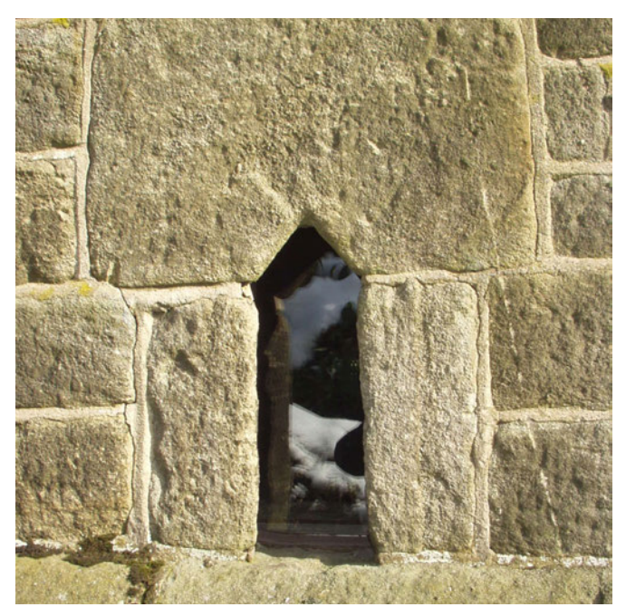
Glazing in a ventilation slot set well back into the reveal and fitted directly into the stone.