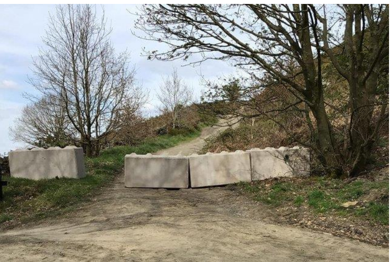
Barricades have been put in place to prevent 4x4 access

Both routes are popular with green laners who drive the tracks using 4x4s and trail bikes. However the pastime, which is legal and not prohibited by law, can leave local authorities facing big bills for surface damage caused by off-road vehicles. The Local Democracy Reporting Service understands Scaly Gate was shut in order for repair work to take place. The closure means it cannot be used by motorised vehicles. However pedestrians, cyclists and horses are unaffected.