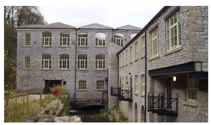
A mill converted for residential use. All openings are original, and a small number of new balconies respond to the industrial character of the building.