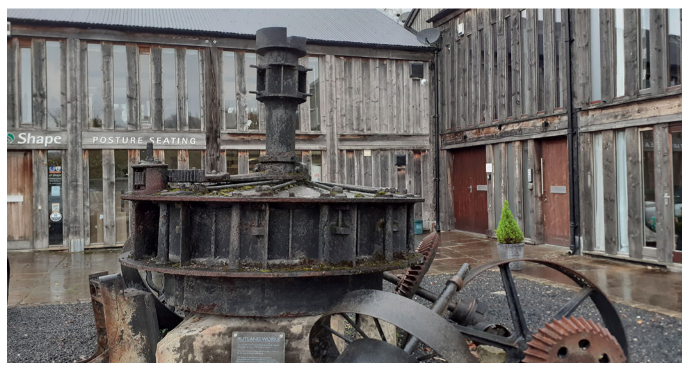
Creative new 'hit and miss' structure reflecting the character of a former timber drying shed, converted for use as office space.

5.65 Contrived new external elements, such as datestones, should be avoided on the principal historic building, as these can blur its history and appear overly domestic.