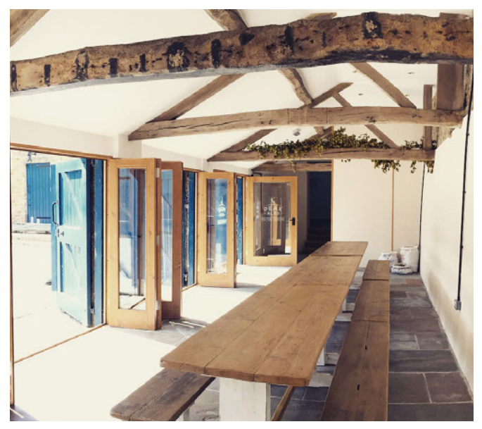
Large openings glazed to full height retain the character and bay arrangement of this former cart shed, now a Visitor Centre.