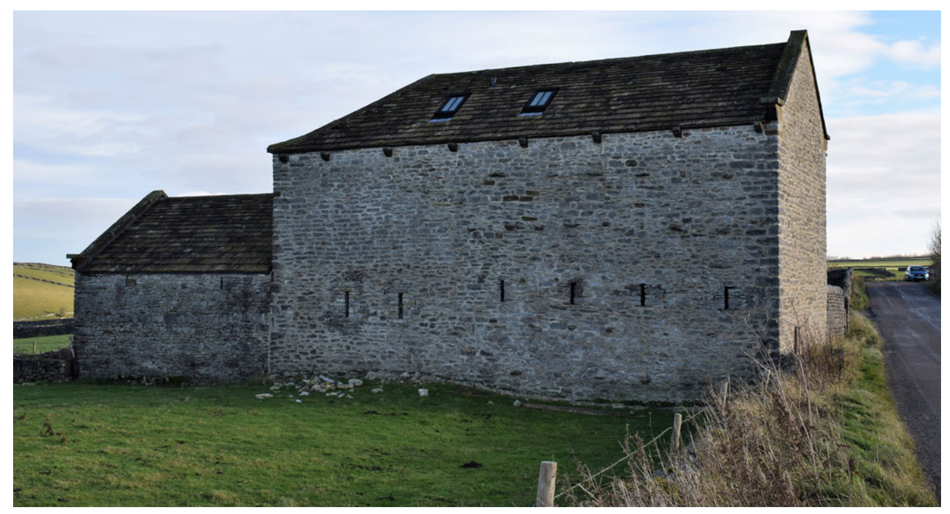
A barn after conversion – the solid-to-void ratio has been maintained. The only alterations on this elevation are two conservation rooflights and two additional vent slits to allow additional light to the interior. All the other original openings are on the opposite elevation.