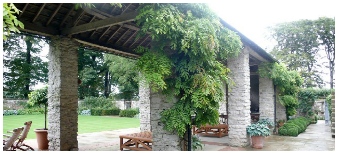
Open-sided barn converted for outdoor domestic use. (© Bench Architects)