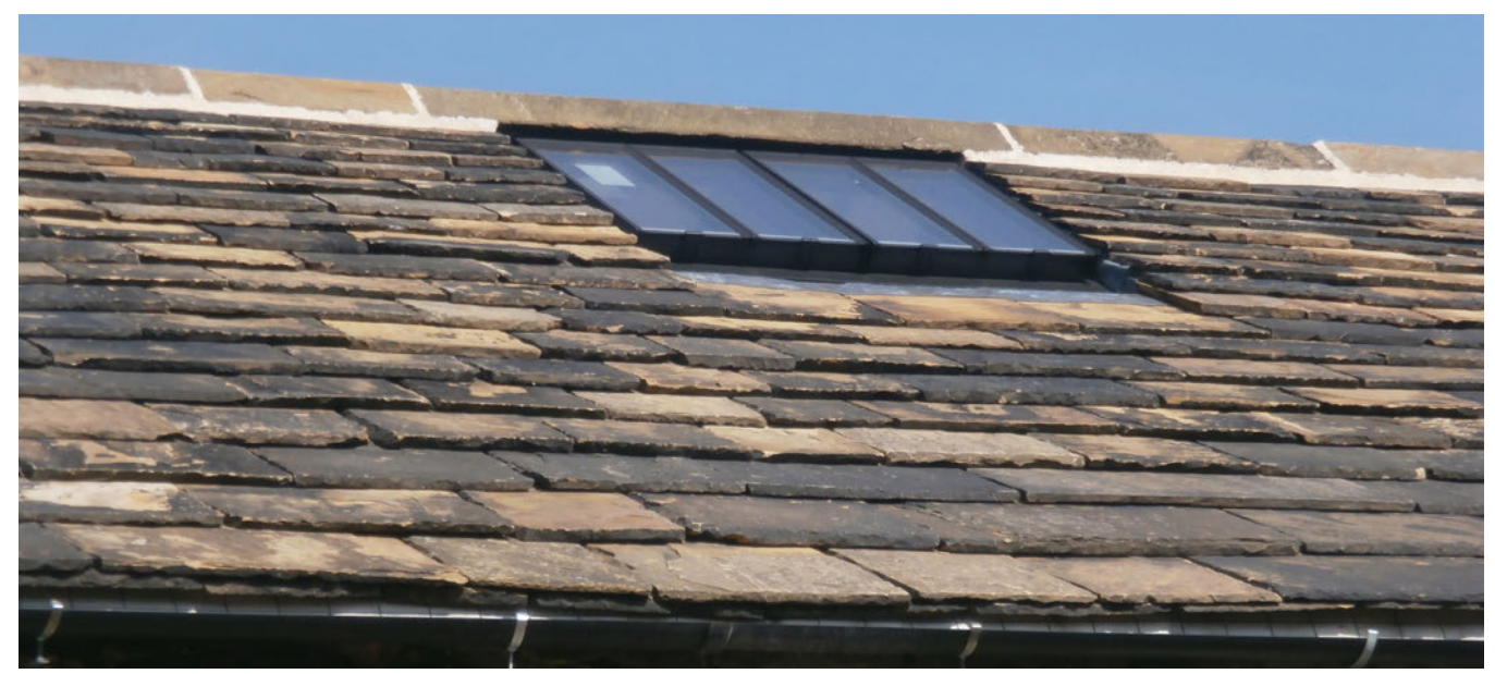
Industrial roof light set flush into a new stone roof along the ridgeline of this converted barn. The agricultural feel of the barn is maintained.