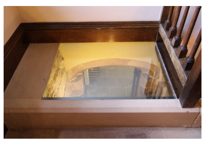
A glass panel in the floor brings borrowed light into a converted basement. (© Bench Architects)