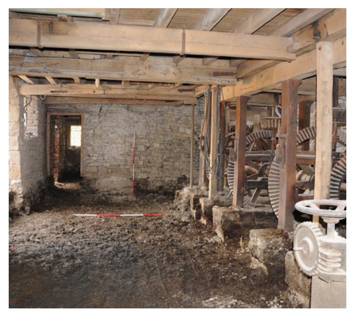
Water-power machinery in situ during archaeological recording of a mill before conversion.