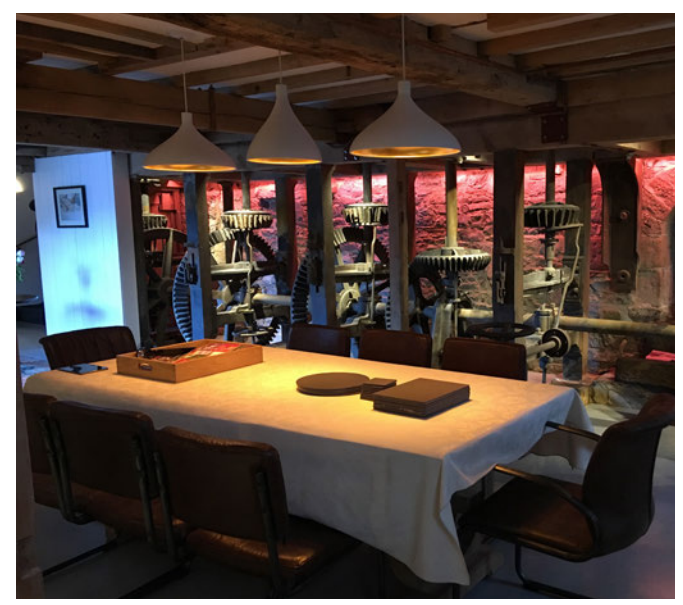
The water-power machinery retained in this mill conversion.