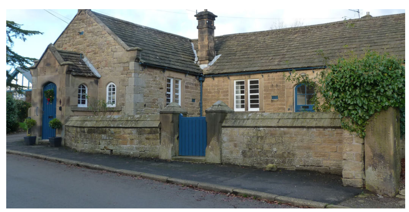
This former school is now a domestic dwelling, but retains its institutional character.