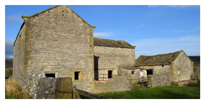
A Peak District outfarm, with buildings around a small yard. There are few openings in the upper parts of the elevations and there is very little surrounding curtilage.

5.14 Schemes should work within the shell of the existing building, avoiding additions or extensions. Where room heights are low, for example, first floor rooms can be partly contained within the roof space as an increase in eaves or roof heights may change the character of the building.