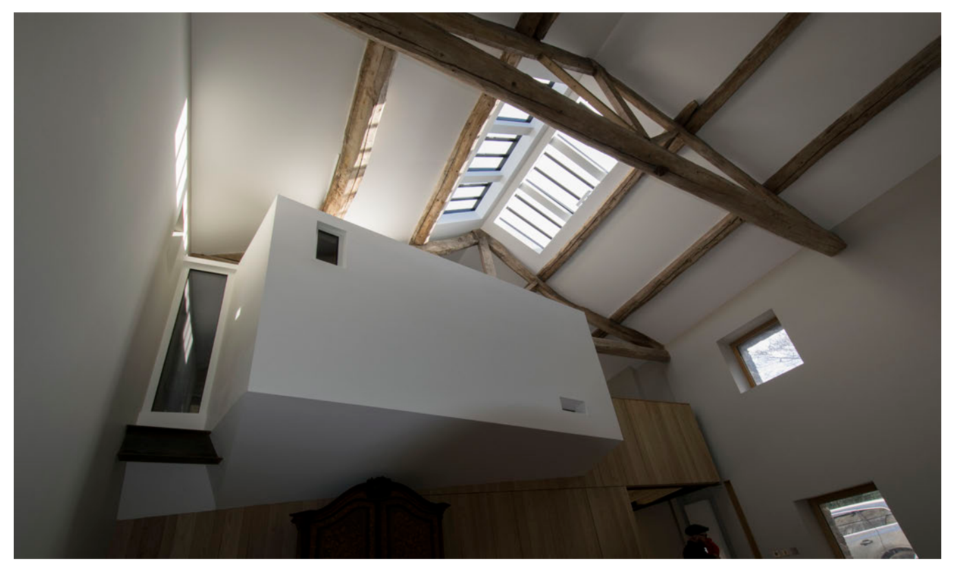
New interior structures in this barn conversion float free of the historic fabric and keep the full height space legible. (© CE+CA Architects)

5.73 Fire prevention systems may need to be specially adapted for historic building conversions. It is preferable to install a radio alarm system (to avoid wiring). The use of sprinkler or water mist systems can sometimes be used to avoid fire compartmentation and the subdivision of large internal spaces, particularly at first floor level in barns. Some historic doors can be adapted to comply with fire safety regulations, for example by the use of intumescent (fire retardant) paints and strips. It may be necessary to alter the design of existing windows for fire escape purposes, and the implications of this should be considered at an early stage.