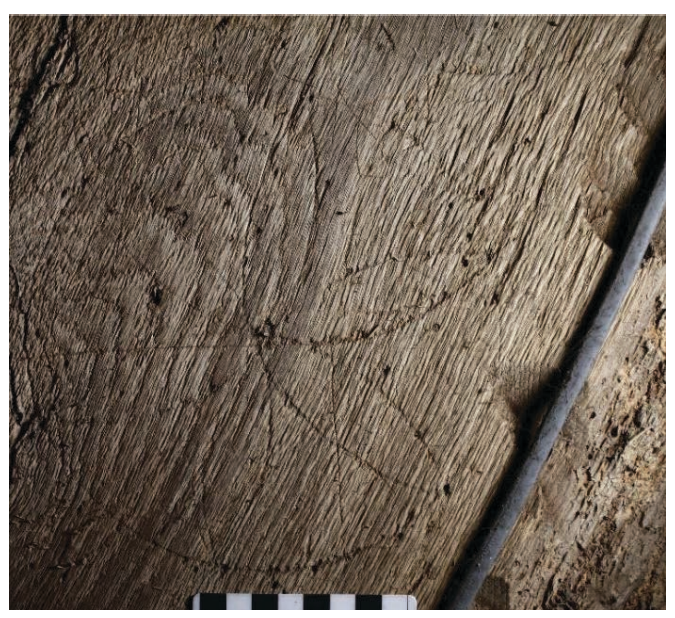
Hexafoil inscribed on a 16th-century cruck blade in a barn.

5.40 Other original internal features, such as decorative treatments and finishes, panelling, graffiti, apotropaic marks, carpenters' and masons' marks, etc., should be retained wherever possible. Cleaning (only if really necessary) should be restricted to gentle brushing to avoid damage to these delicate traces.