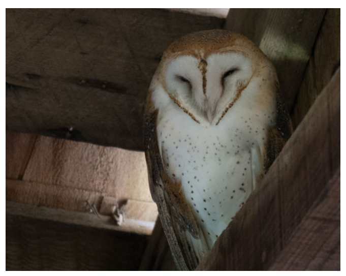
Barn owl.