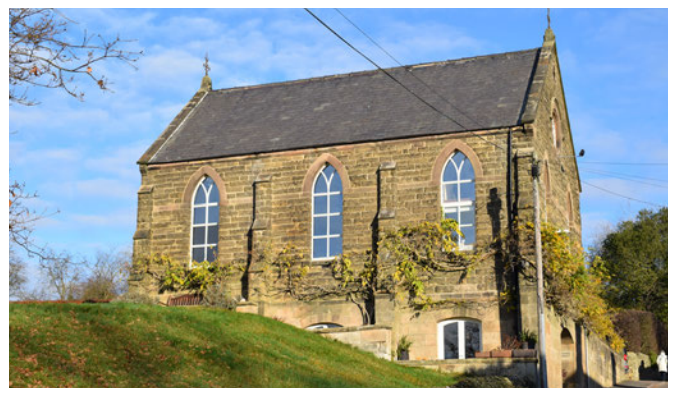
A converted chapel retains the strong symmetry created by the windows. On the elevation facing the street, the original stained glass has been retained in the upper portions of the new windows.