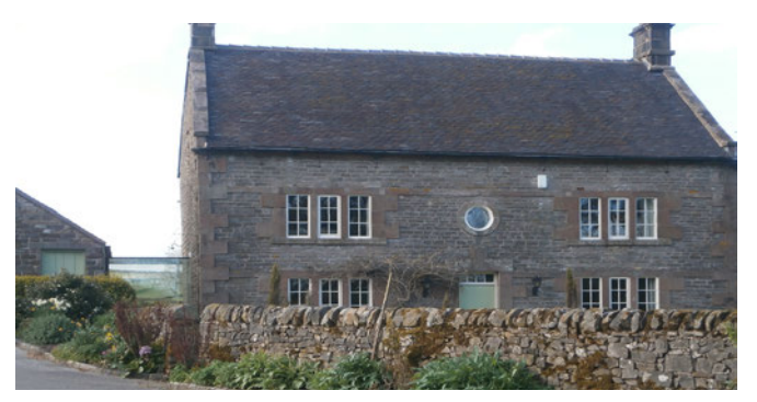
A 'light touch' glazed link between a house and converted barn – both buildings are listed.

<sup>11</sup>For example, radon pipes must be sited externally