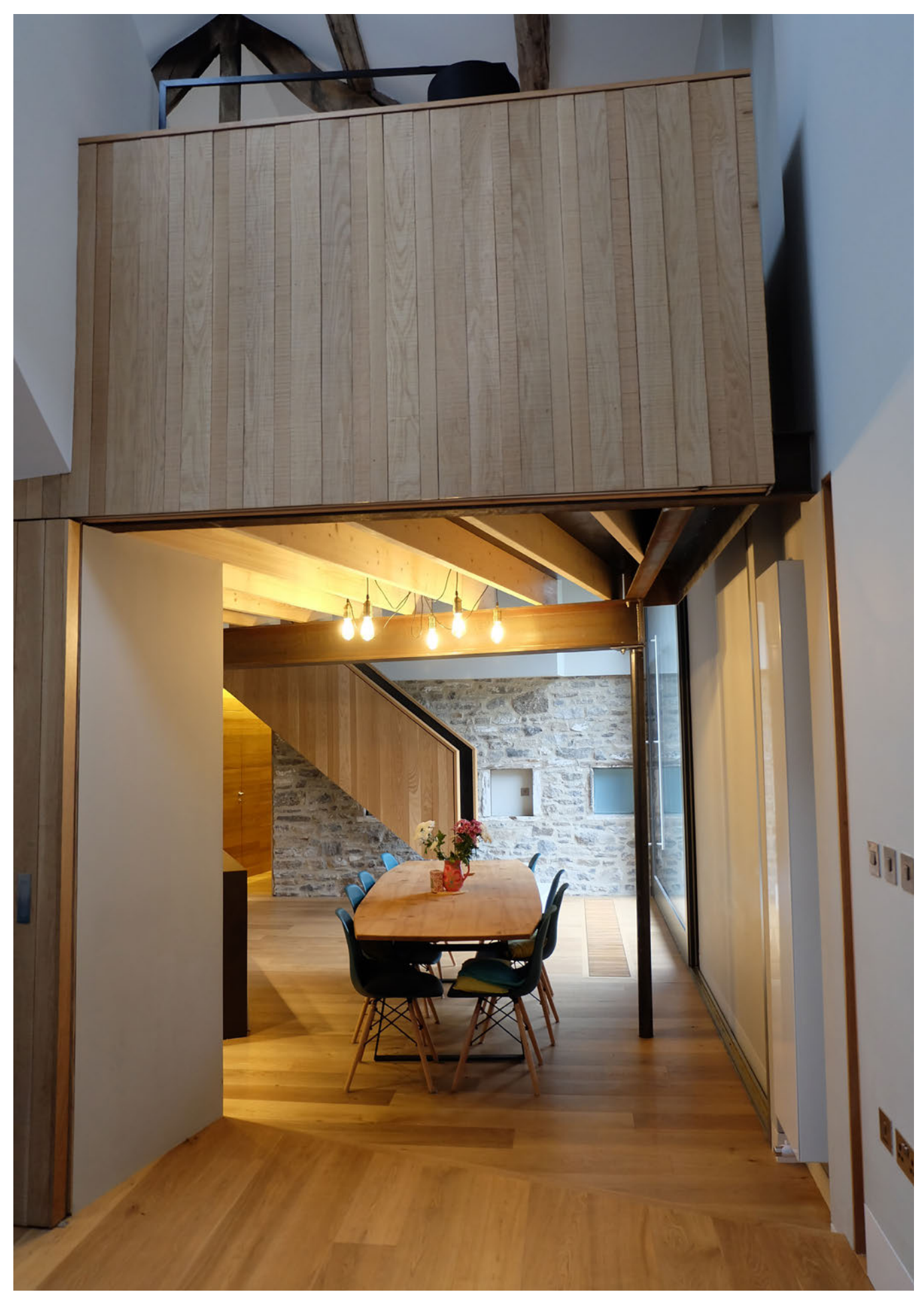
Barn converted into dwelling. ( \ensuremath{\mathbb{C}} CE+CA Architects)