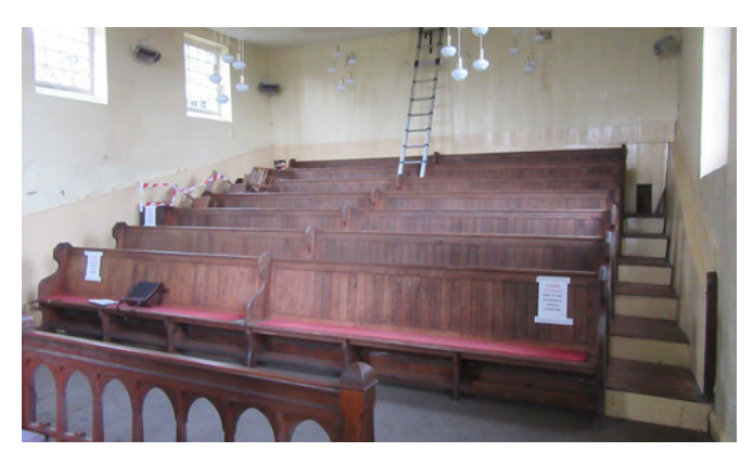
The simple open interior of a disused Methodist chapel with pews and other internal fittings. These spaces can pose design challenges that require a creative and sensitive response.