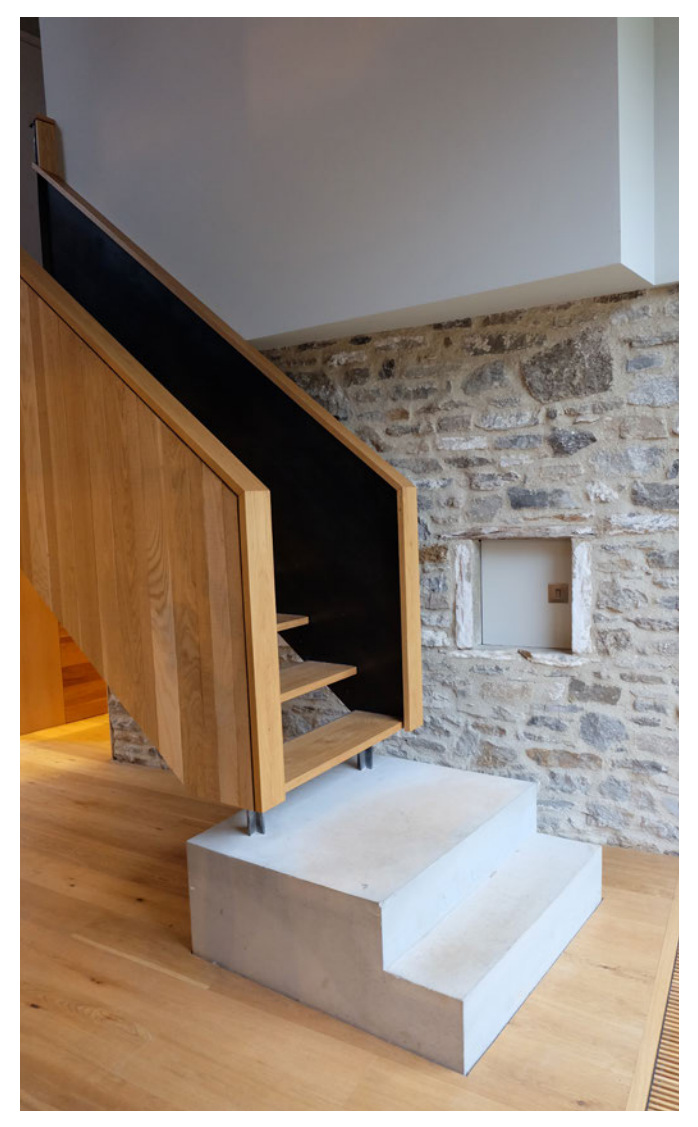
Contemporary design in a historic building - a simple palette of materials, including concrete, finished to a high specification in a barn conversion. (© CE+CA Architects)