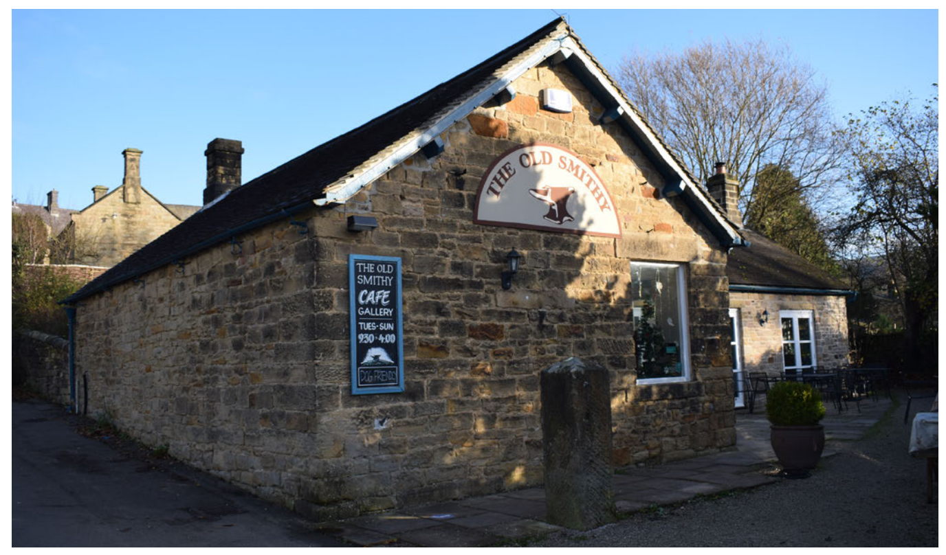
Former smithy converted into a café - the plain façade on the street frontage has been retained.

5.26 Conservation is not the same as preservation. Historic England defines conservation as 'the process of managing change to a significant place in its setting in ways that will best sustain its heritage values, while recognising opportunities to reveal or reinforce those values for present and future generations<sup>10</sup> That is why it is so important to understand the significance of the building as the first step in the design of a conversion proposal.