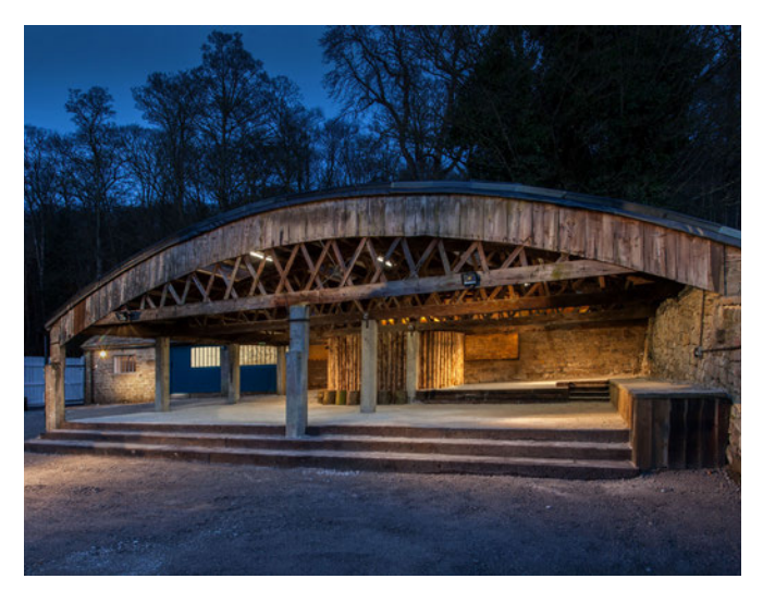
An early 20th Century open-sided barn, with Belfast trusses, converted into a covered outdoor education space. The simple design and utilitarian materials reflect its former agricultural use.