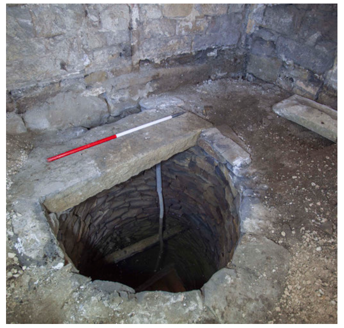
A well revealed below the flagstone floor inside a building.