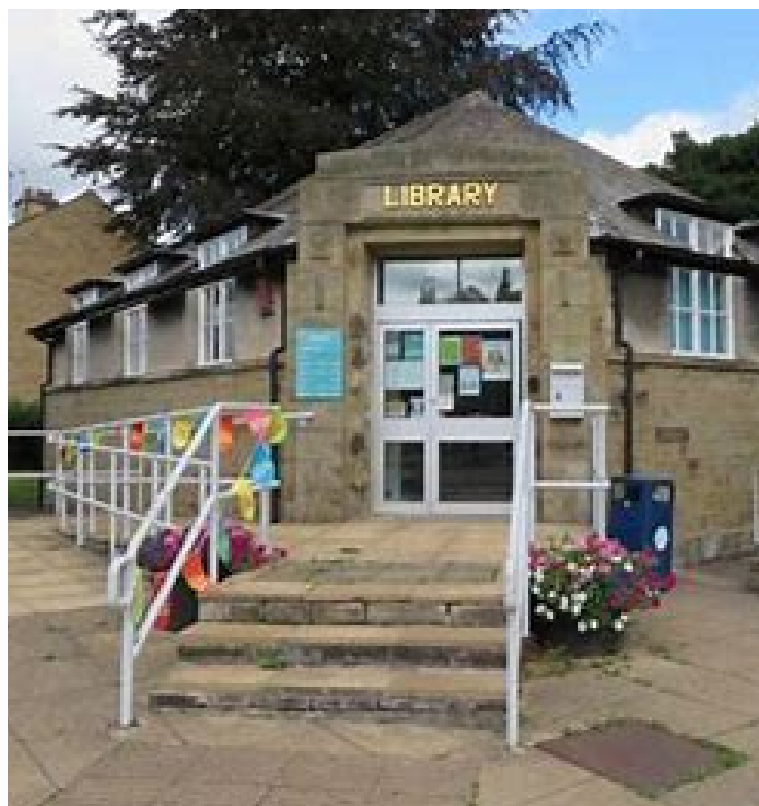
Honley Library is owned by Holme Valley Parish Council and managed by the Friends of Honley Library

We have continued to maintain the many assets for which we hold responsibility on behalf of the community. These include the Holmfirth public toilets, benches, war memorials, decommissioned telephone boxes, dog waste bag dispensers and stone bus shelters. I would like to thank our maintenance contractor and also the many volunteers who ensure that these facilities remain available for the benefit of the community and of visitors to our beautiful valley.