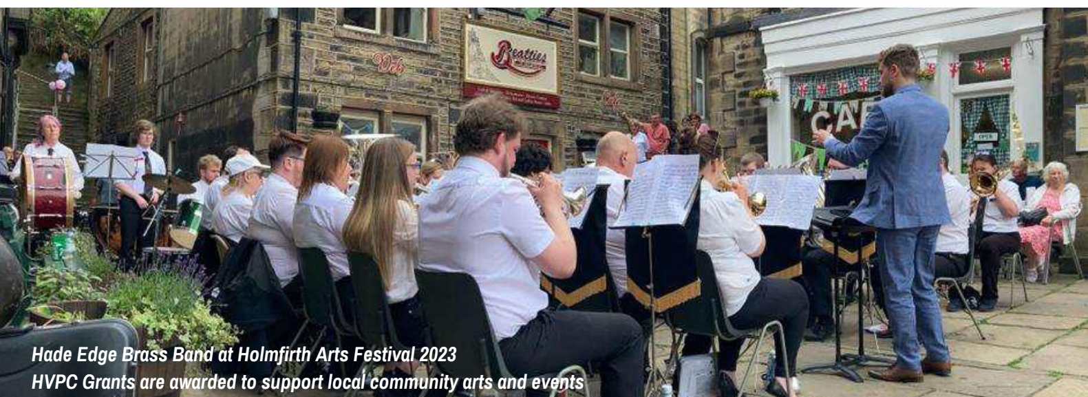
Hade Edge Brass Band at Holmfirth Arts Festival 2023 HVPC Grants are awarded to support local community arts and events

Detailed financial statements are available on the Council's website.